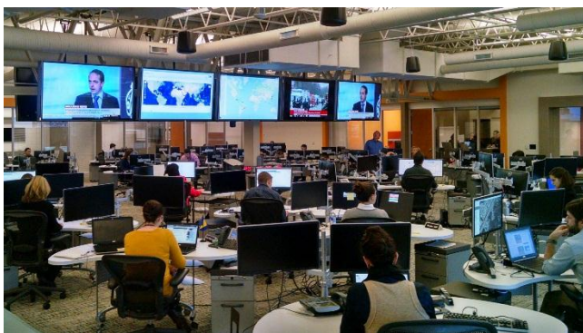
iJET Global Integrated Operations Center