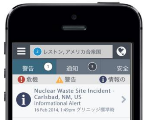
Multilingual Alerts in Japanese